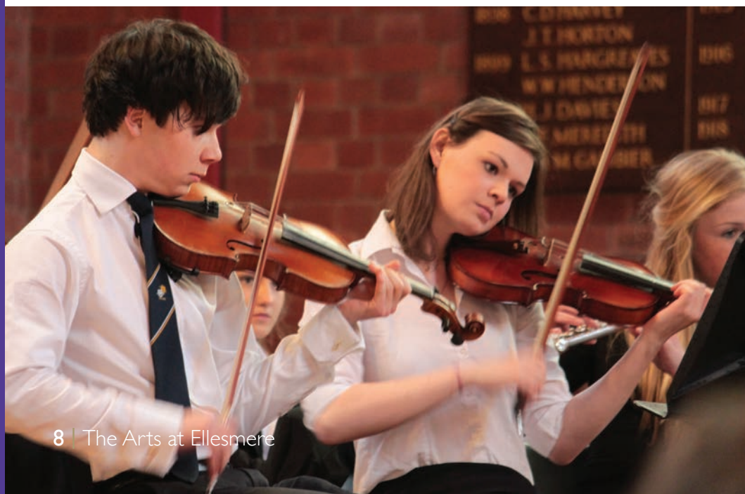
8 | The Arts at Ellesmere

Students involved in the Arts Award regularly experience varied artistic workshops by visiting professionals, while 'The Edge' Sixth Form talks give our students the chance to listen to the advice and experience of successful artists. The annual concert, coordinated by the pupils, gives all musicians, budding thespians and poets, from Year 9 upwards, a chance to present their own original work.