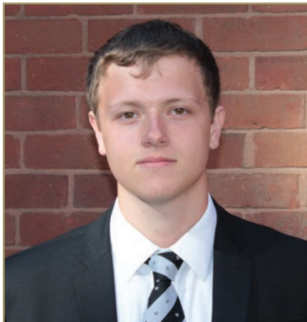
BOBBY ORR A*A*AA HISTORY AT EXETER UNIVERSITY